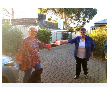
Pastoral care in actionhas toilet paper!